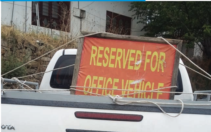
The sign made me do it! A case of taking things too literally?