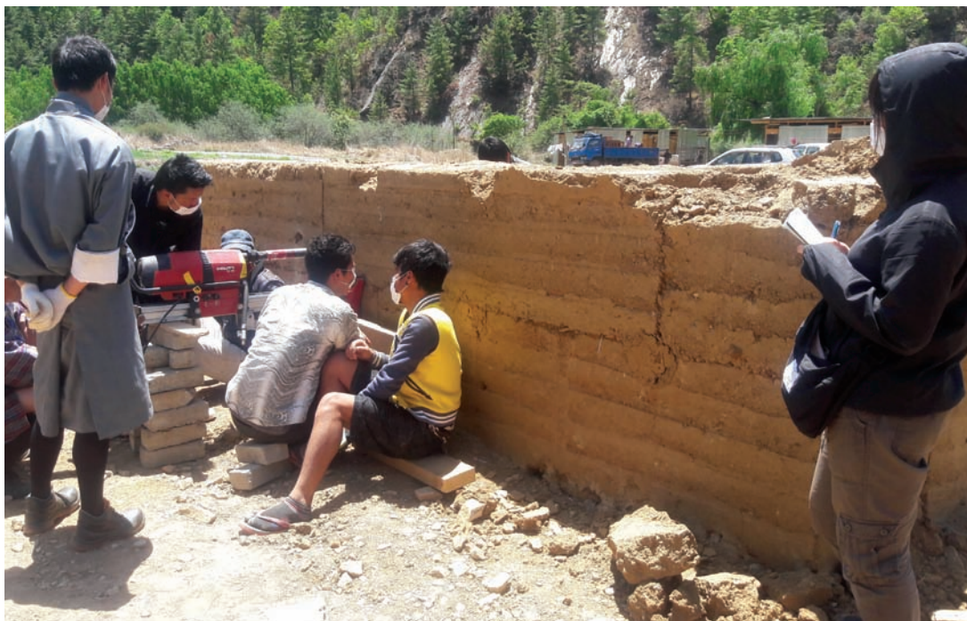
Technicians drill into a mud-rammed wall to draw samples to be used to determine the level of earthquake resistance of traditional buildings