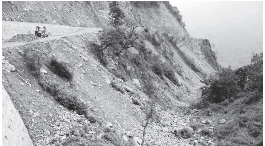
Debris from road construction has blocked the water going to the irrigation channel

"With the previous irrigation channel, many tributaries joined the stream from below the road even if the stream from the source became small. It was enough for paddy cultivation," said Namgay Wangdi. He added that it would be of great help to the people if DoR main-