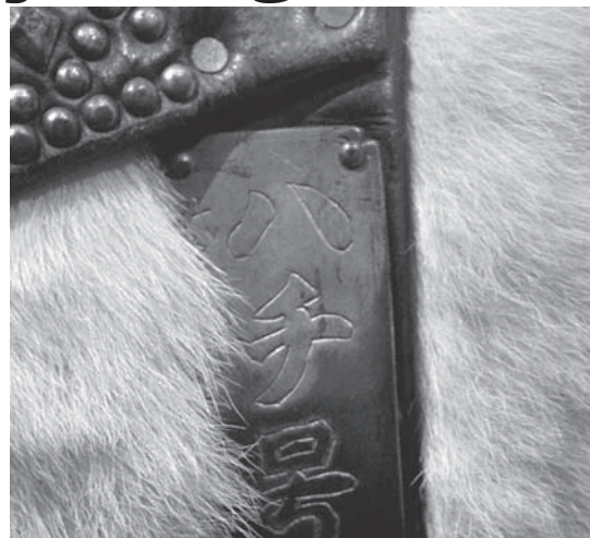
A part of the harness worn by the stuffed specimen of Hachi owned by the National Museum of Nature and Science

The recently discovered photo suggests that Hachi may have often visited places east of