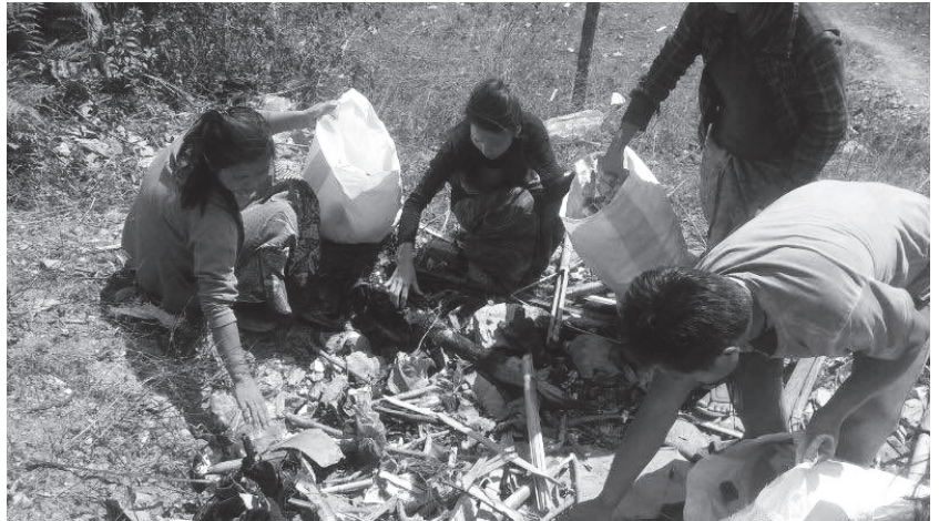
Villagers take part in regular clean up campaigns